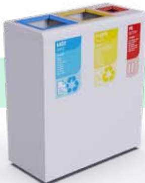
Tri With Battery