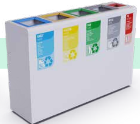
Leed With Battery