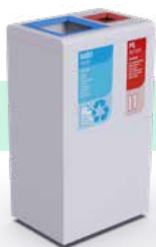
Duo With Battery