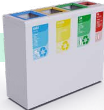
Tetra With Battery